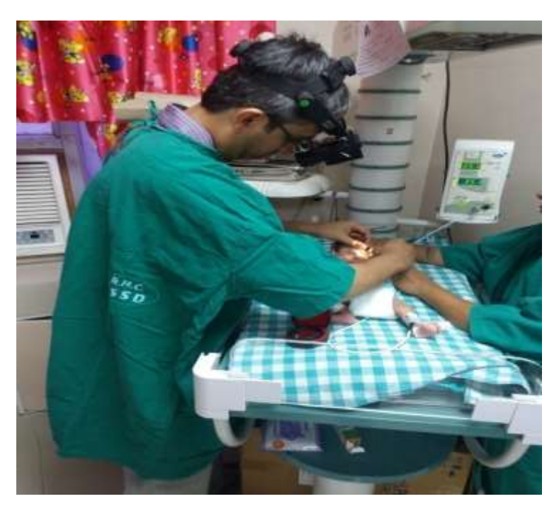
Figure 3: ROP screening being done at NICU Ruby hall clinic using a INDIRECT OPHTHALMOSCOPE