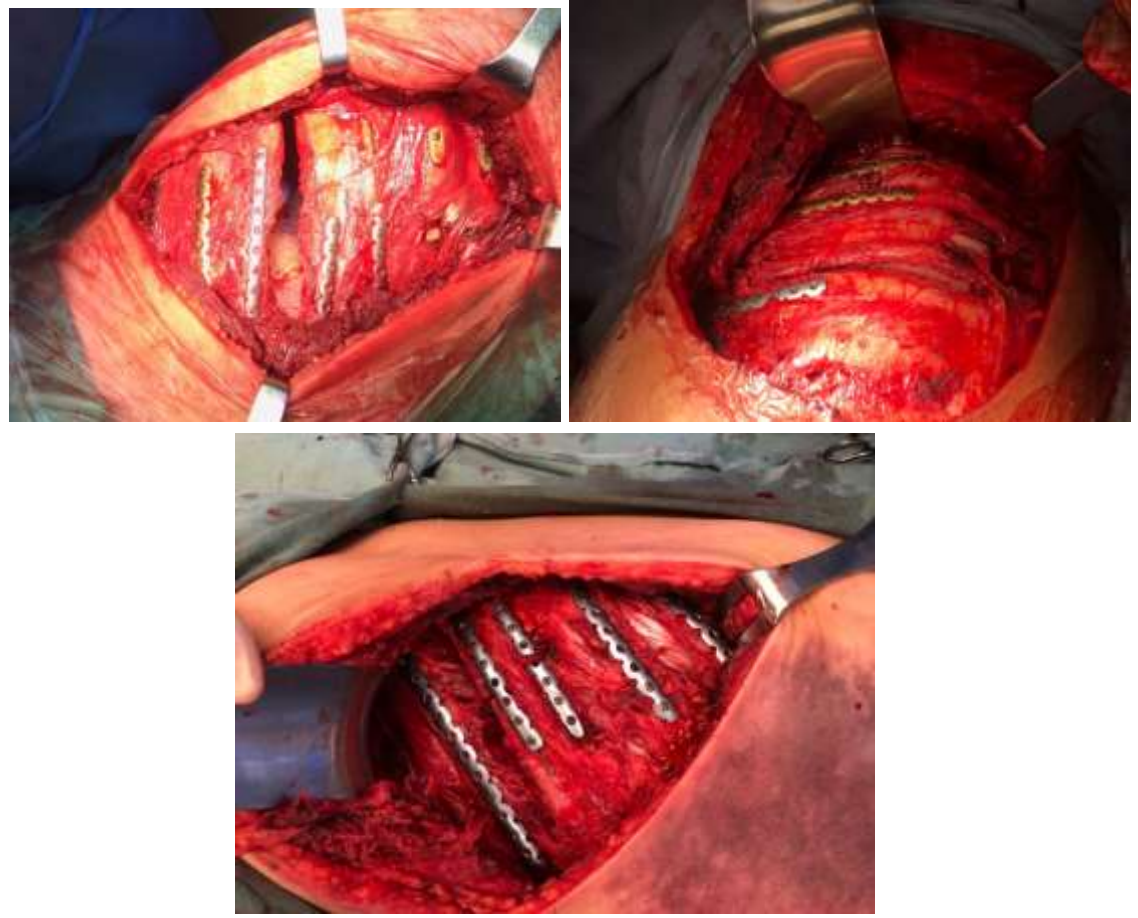
Fig 3. Rib repaired with plates or intramedullary splints