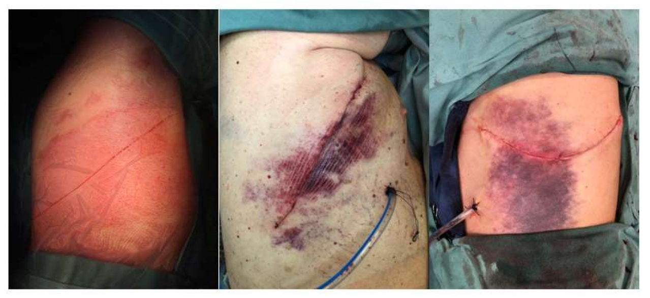
Fig 2. Incision Approach