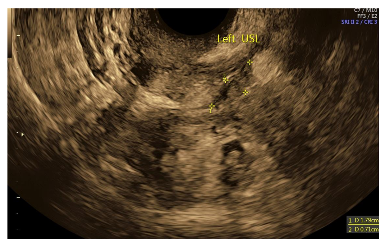
Figure 4:DIE nodule of left uterosacral ligament