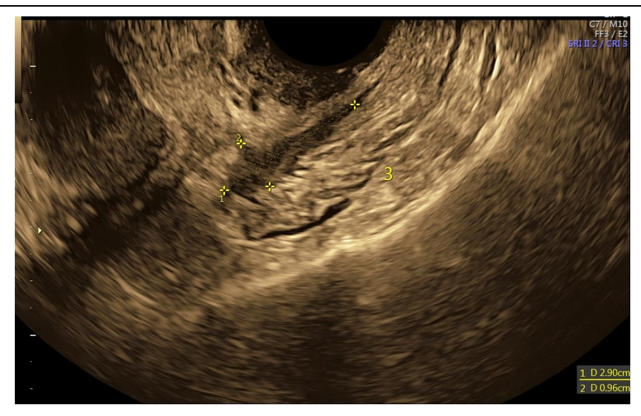
Figure 3: Full thickness bowel involvement with deep infiltrating endometriosis.