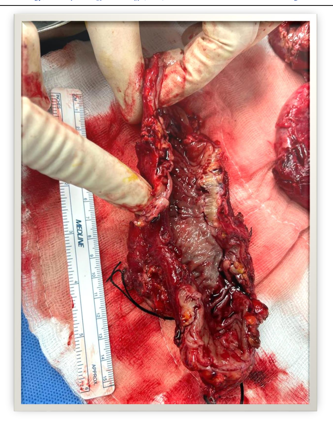
Figure 1: 15cm segment of rectosigmoid colon with multiple sub occlusive DIE nodules

Charles B Nagy, (2023). Deep Infiltrating Endometriosis Presenting with Subacute Bowel Obstruction and Pelvic Abscess. MAR Gynecology & Urology 5:6 .