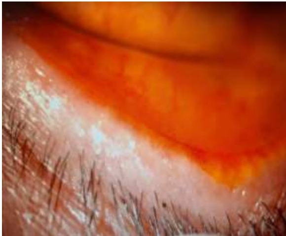
Figure 3: Free edge telangiectasia