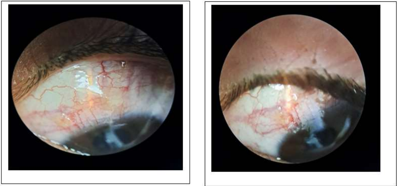
Figure 2: Nodule regression under treatment