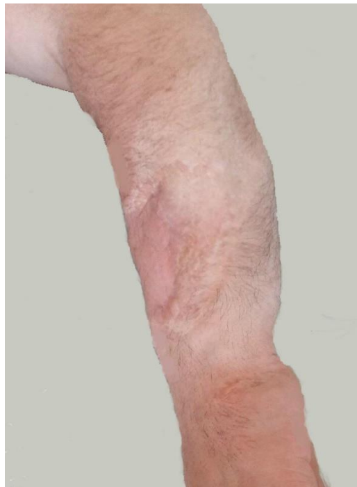
Fig. 2: Visual result of the defect area