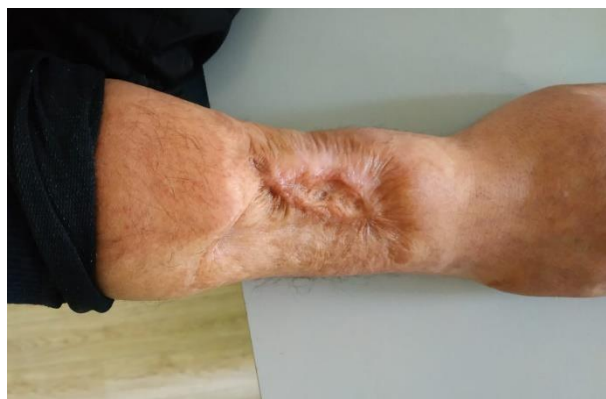
Fig. 3: Preoperative picture