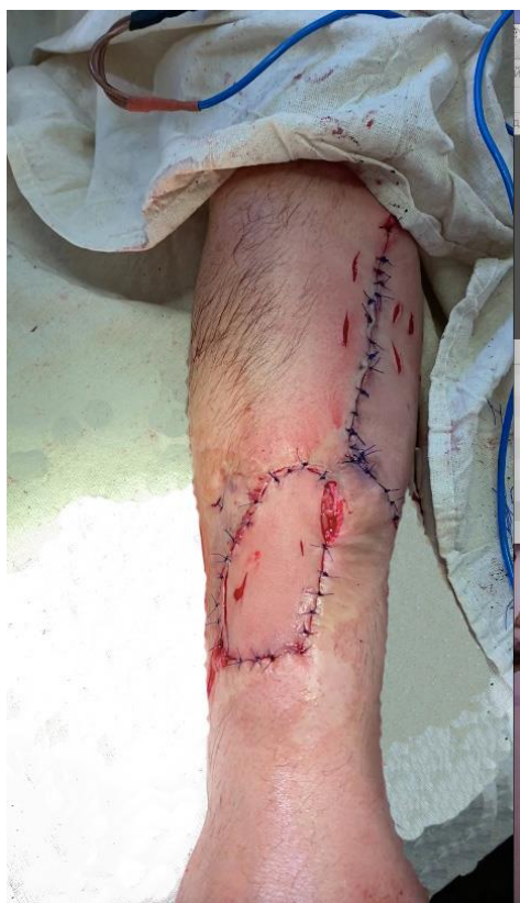
Fig. 5: Result immediately on the operating room