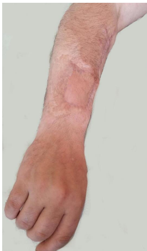
Fig. 6: Flap after 2 months