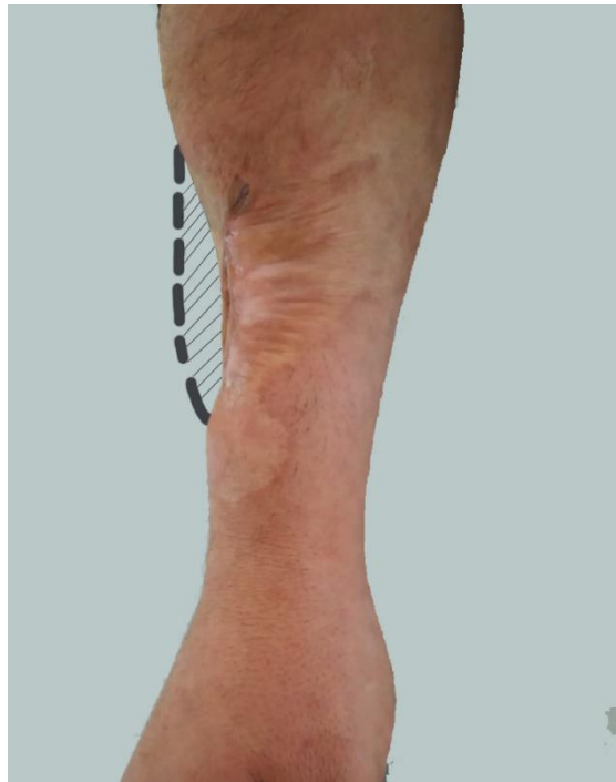
Fig. 1: Schematic marking of the defect