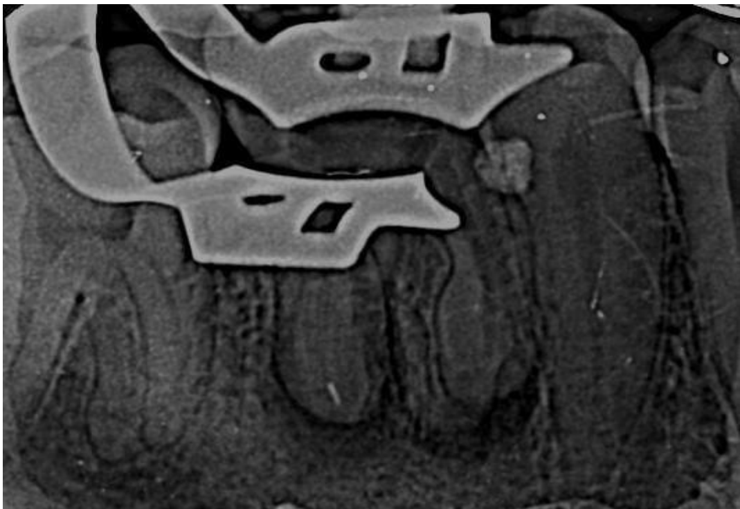
Figure 2 - Reciproc classic Third use tooth 46, fracture at source Distal.