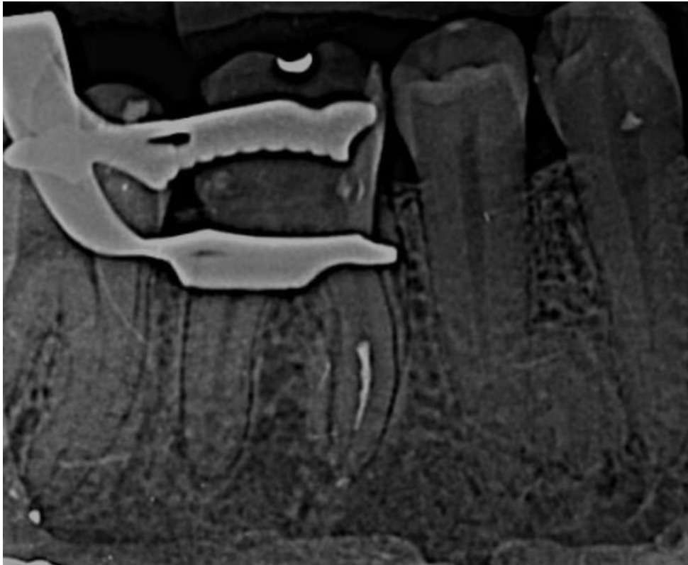
Figure 5 - wave One gold First use Tooth 46, fracture at source mesial.