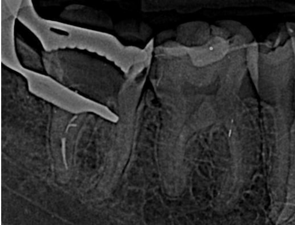
Figure 3 - Reciproc blue second use tooth 47 fracture at source distal.