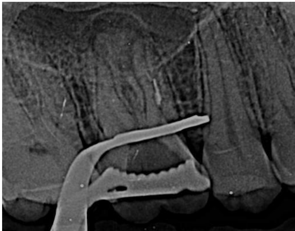
Figure 6 - wave One Gold Third use tooth 16, fracture at source mesium entrance exam.