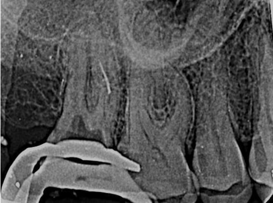
Figure 1 - reciproc classic Third use tooth 17, fracture at source mesio entrance exam.