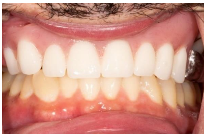
Figure 10: Final prosthesis during lip retraction

The patient's comfort and adaptation to the newly increased vertical dimension of occlusion (VDO) was verified using a removable transition prosthesis (Fig. 9). The final prosthesis was fitted with a metal frame that covered the occlusal surfaces of the remaining posterior teeth. Cast circumferential clasps were placed on teeth #26 and 27. Intaglio's acrylic allowed for easy adjustments to maintain adequate soft tissue adaptation over time.