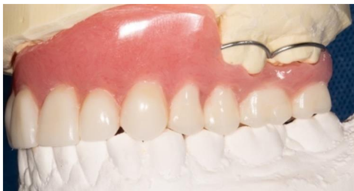
Figure 9: Removable transition prosthesis

Therefore, the prosthesis used was a removable acrylic partial prosthesis with a double chrome/cobalt mesostructure, including the Integrated Bar™ being the built-in bar. The other metal structure was the partial's metal skeleton and the two structures were joined together by acrylic. The retention of the prosthesis was ensured by the 4 implants and the remaining 3 teeth #17, 26 and 27. The four custom made transscrewed implants abutments were paired to the Integrated Bar™ female attachments by way of resilient compressible nylon sheaths.