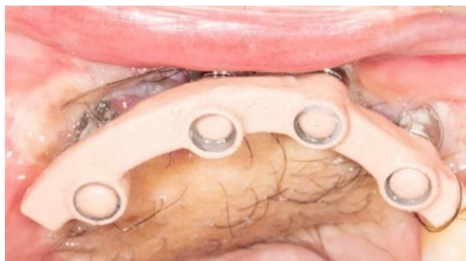
Figure 8: The female retention elements are reindexed within the integrated bar directly in the mouth.

In addition, the custom-made intermediate prosthetic abutments manufactured from Pantera Dental make it possible to reach the required height and parallelize the male portions, which increases the system's retention and reduces the wear and tear of nylon sheaths (Fig. 7). To ensure passivity between implants and the bar, the implants female retention elements were reindexed with a composite cement (3M™ ESPE™ RelyX™ Unicem, 3M Co., Maplewood, MN, USA) on a bar that is itself wrapped around the final prosthesis (Fig. 8).