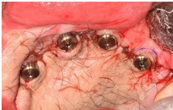
Figure 4: Flap sutured in place

Four Nobel Replace Conical Connection TiUltra RPTM (Nobel Biocare Inc., Kloten, Switzerland) implants of 4.3 x 10 mm were placed in positions #12, 14, 22 and 24 according to manufacturer's drilling protocol. The healing abutments were are juxta-mucous despite their 7 mm height due to the flap thickness (Fig. 4). A six-month healing period was followed before initiating the prosthetic phase.