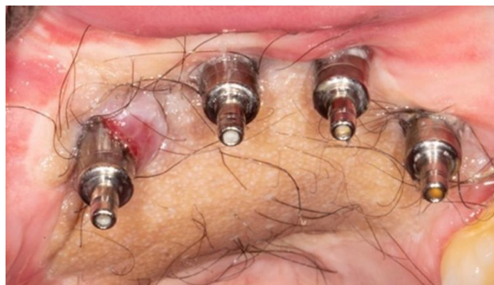
Figure 6: Peri-implant tissues 22 months after implant placement

Seven months after the first tissue correction, a second skin flap reduction surgery was performed. During this surgery, the custom-made transmucosal prosthetic abutments were placed.