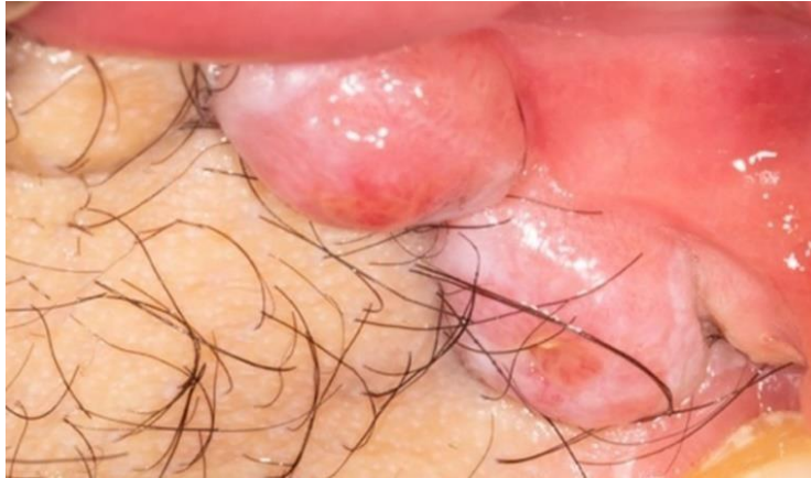
Figure 5: 6 months after implants placement, erythematous hyperplastic tissue covers the healing abutments.

Peri-implant tissue management represented a clinical challenge. Skin flaps do not share the same characteristics as mucogingival tissues. Soft tissues' mobility and lack of attachment around implants resulted in increased inflammation and hyperplastic tissues (Fig. 5).