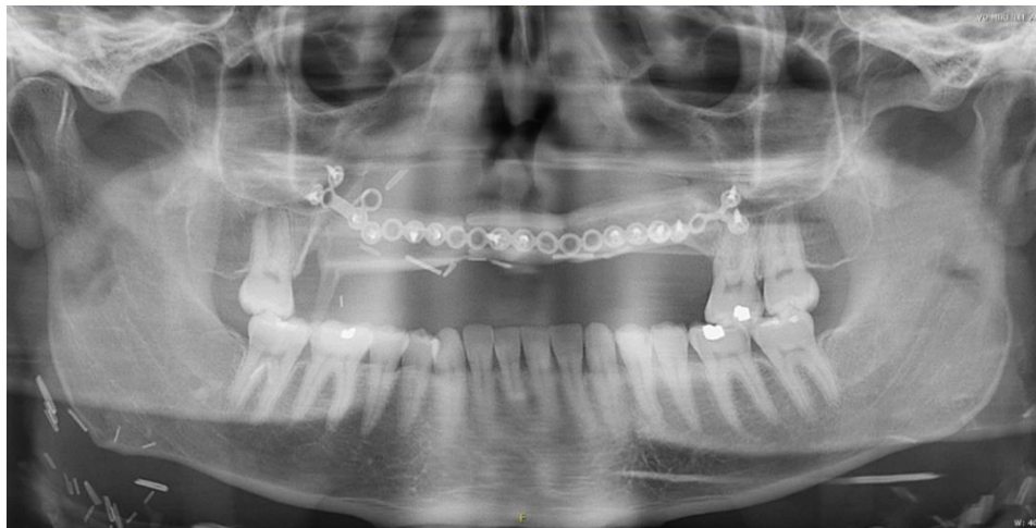
Figure 1: Patient's initial panoramic X-ray

The initial assessment revealed that the middle third of the face had undergone alterations following the surgery. A skin flap extending from the nasolabial fold to the vermilion border substituted the middle part of the upper lip. This displacement did not allow a proper labial seal. The face profile was marked by sagging of the lower nasal portion and loss of upper labial support. The intraoral examination revealed a pilose mobile skin flap replacing the palate's anterior two-thirds. Only teeth #17, 26 and 27 were still present in the upper jaw (Fig. 1). Tooth #17 was partially covered by the flap. Additionally, the maxillary buccal vestibule was absent. No mandibular alterations of the teeth or soft tissues were noticed.