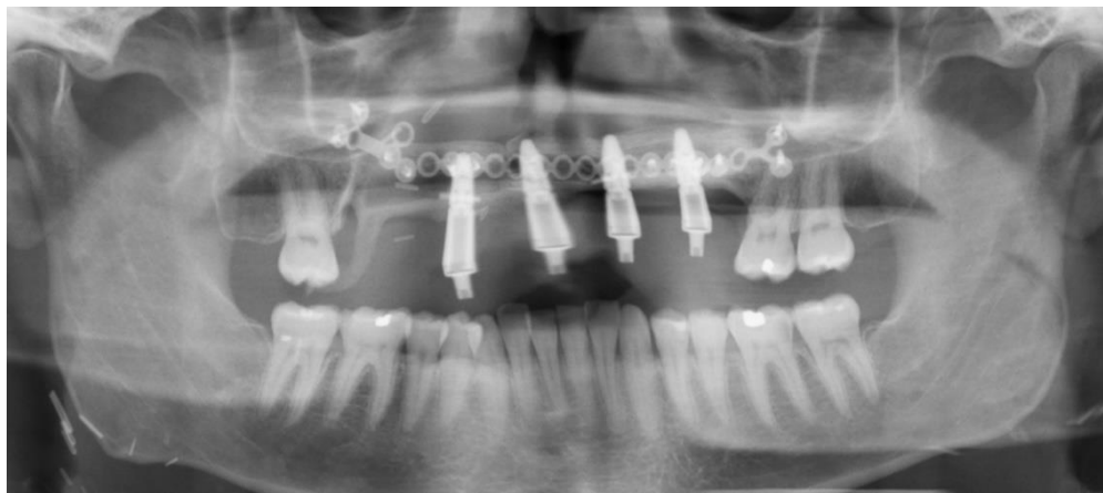
Figure 11: Panoramic X-ray 11 months after implant placement

At the one-year follow-up, the patient was still satisfied with the aesthetics and chewing function provided by the implant-supported prosthesis. Adequate daily hygiene was confirmed by the healthy appearance of peri-implant tissue.