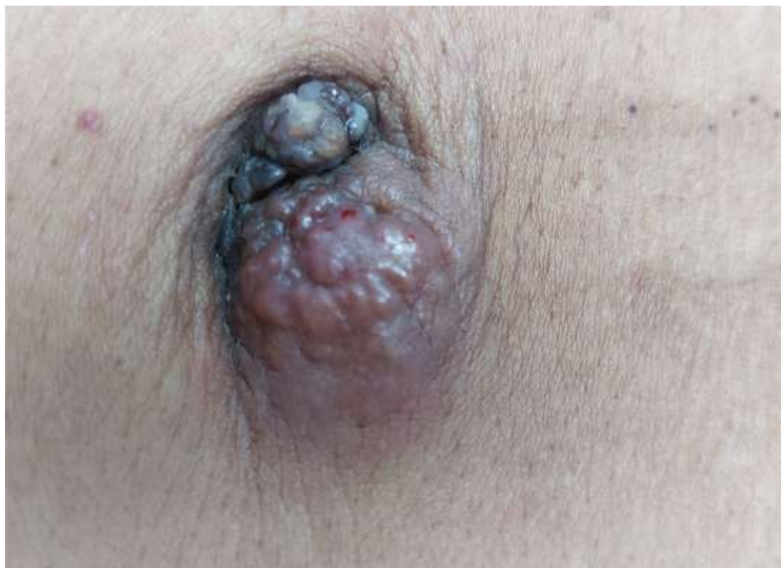
Figure: 1. Umbilical reddish white nodule with mild surface ulceration