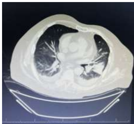
Fig 2: Findings suggest left lower lobe collapse-consolidation with air bronchograms (sparing the superior segment), associated with subsegmental atelectasis in the right basal lung and mild bilateral pleural effusion (left > right).

A multidisciplinary team was involved, including ICU specialists, internal medicine, cardiology, and surgical teams. Close hemodynamic monitoring and laboratory surveillance were continued, and the patient responded gradually to supportive care.