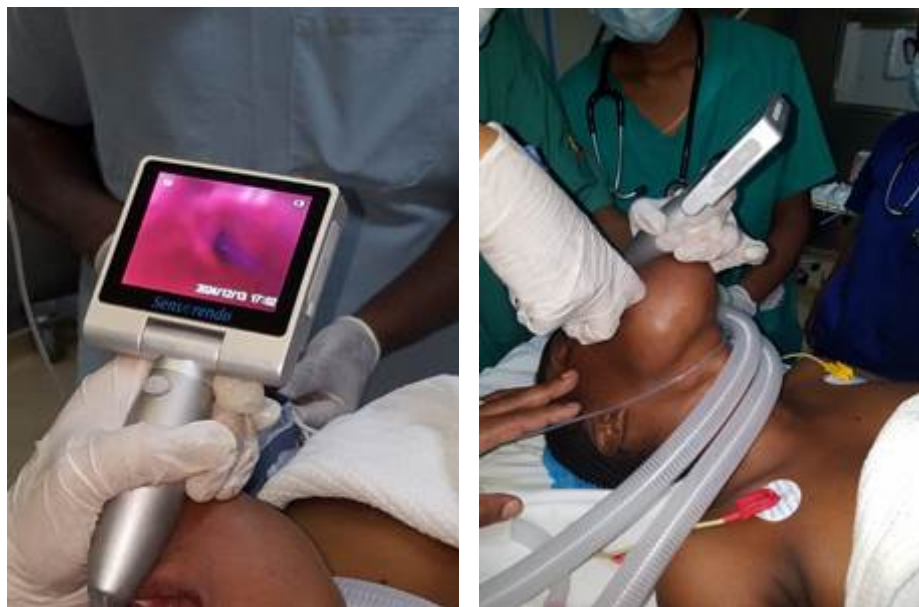
Figure 4. Nasal intubation, general anesthesia