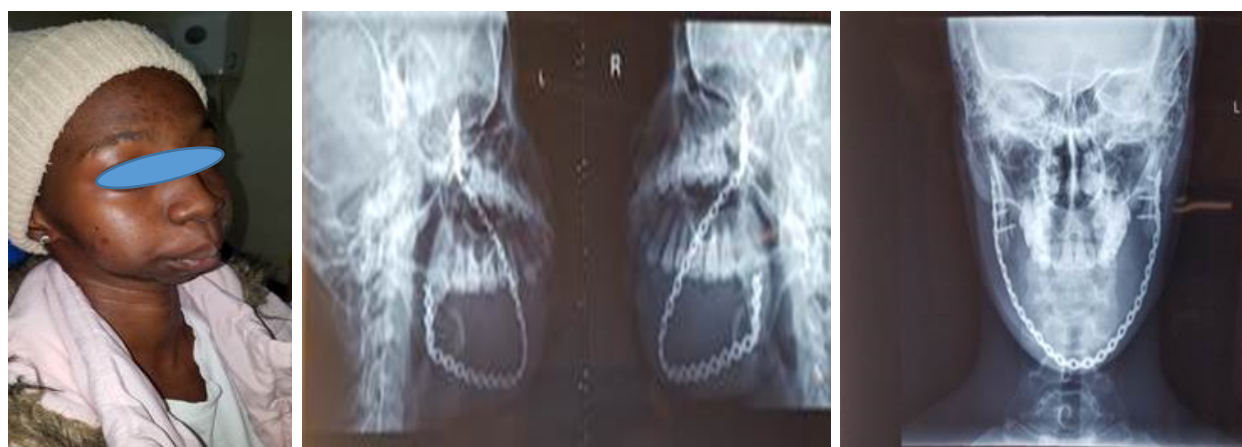
Figure 6. Post-operative results

The surgical specimen was again submitted to histopathological analysis, which verified that the margins were tumor-free. This patient remains free of any signs of recurrence following clinical and imaging examinations periodically and she has received prosthetic rehabilitation with functional and aesthetic satisfaction. Clinically and radiographic examination (figure 6) were made to verified post-operative result.