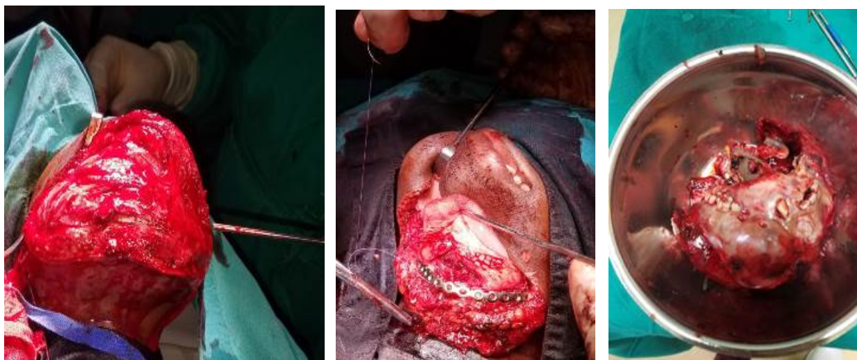
Figure 5. Surgical management and reconstruction

The surgical specimen was again submitted to histopathological analysis, which verified that the margins were tumor-free. This patient remains free of any signs of recurrence following clinical and imaging examinations periodically and she has received prosthetic rehabilitation with functional and aesthetic satisfaction. Clinically and radiographic examination (figure 6) were made to verified post-operative result.