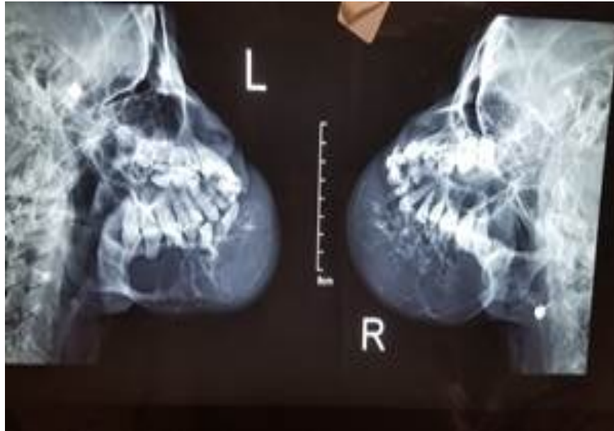
Figure 3. X- Rays examination preoperative

The bone defect was repaired and reconstruction was made with Titanium plate (Figure 5 A,B,C)